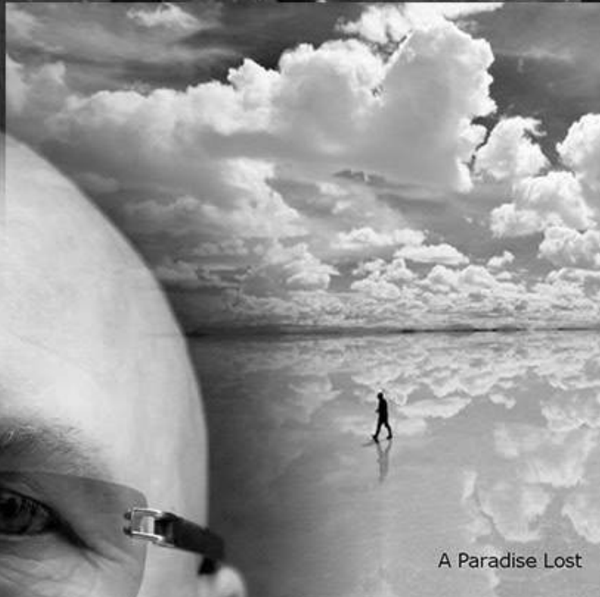
A Paradise Lost

Tracks: 'At My Heart' (album A Paradise Lost) 'Going North' (album Compass)