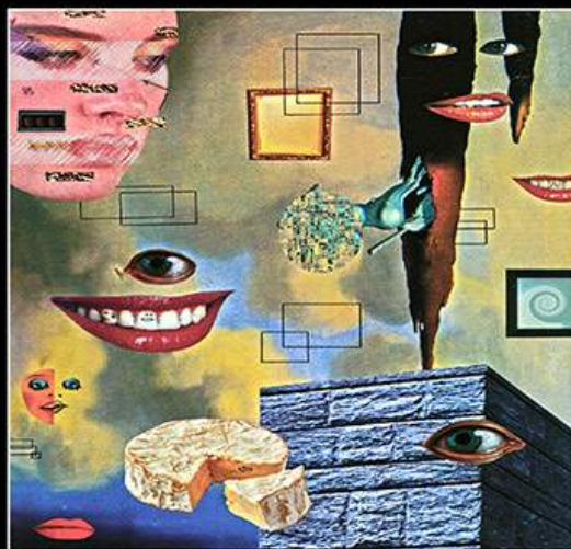
Caves Full Of Clouds

Released on MindMusic Records in 1985, the third album of Jihel "Caves Full Of Clouds" contains the complete music made for two documentary films directed by Louis Viallat, "Secret Caves" and "Stratospheric Sondes".