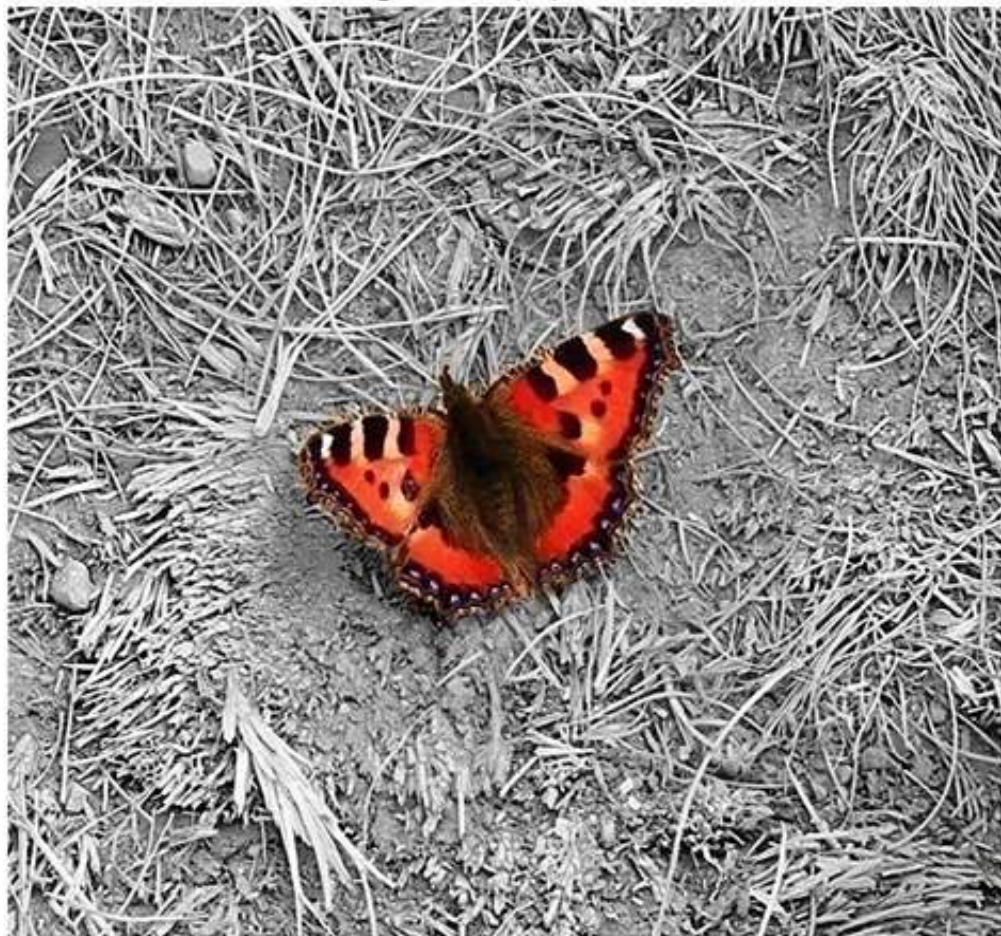
Planet of the Butterflies

DigitalSimplyWorld reaches the ends of the classical electronic music, where everything becomes different. There looking for a new experience in sound. World of sounds created by the DSW are full of emotion, melody, combined with the hypnotic sound of all kinds, takes in new areas of dreams.