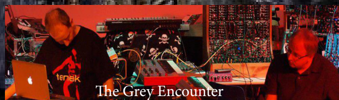
The Grey Encounter