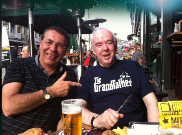
Okay! I'm a grandfather, if you keep pointing, you know where this knife is going.