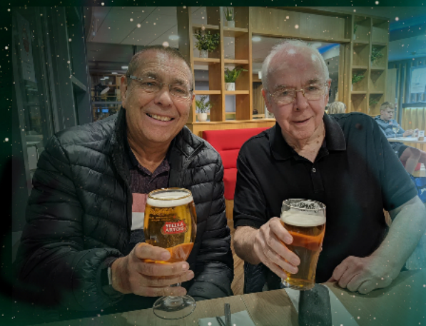
Needed glasses for closer inspection of the good stuff.