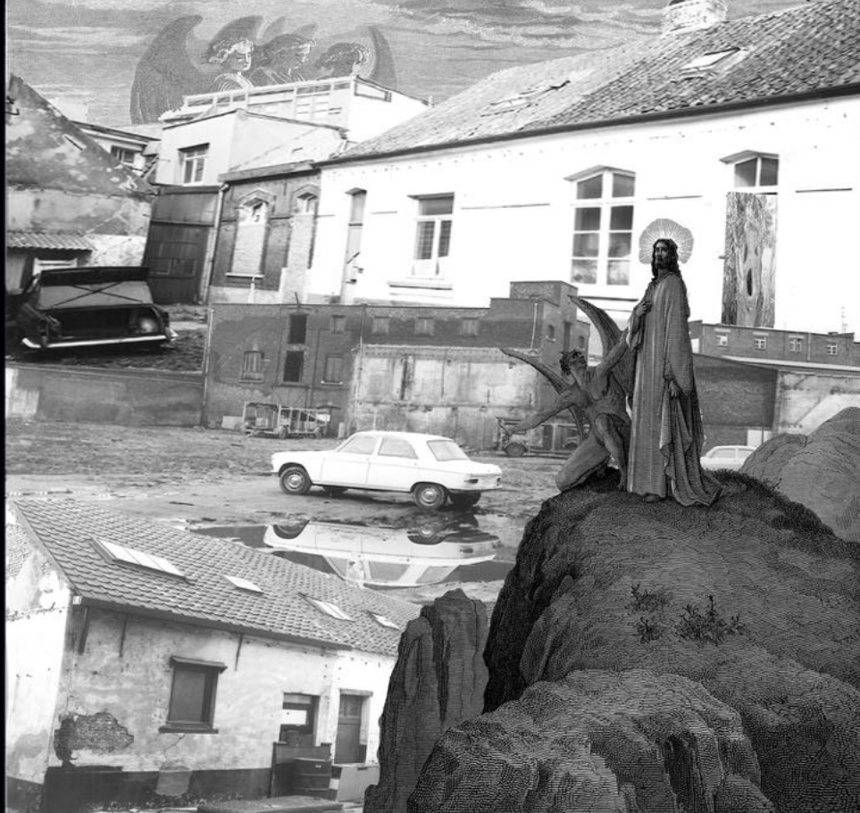
Onsturicheit Wanneer de herder dooit, zo dolen de schapen