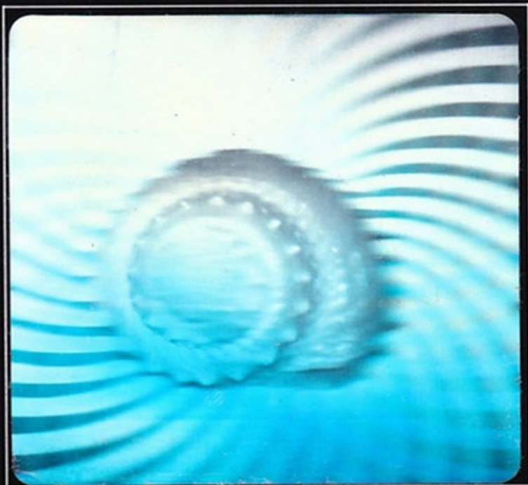
The Ultimate Digital Adventure