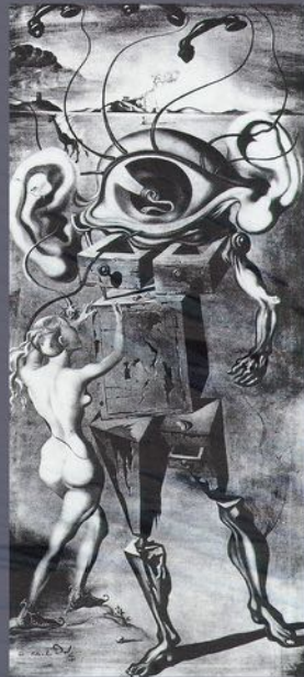
Salvador Dalí - The Art of Cinema (1944), destroyed in a fire.

The tracks on the album are musical interpretations of eight lost, destroyed or not yet found stolen paintings. Cover design is based on an engraving depicting Leonardo's Battle of Anghiari.