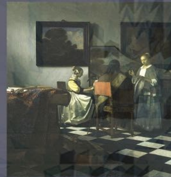
Johannes Vermeer - The Concert (1664), stolen in 1990.