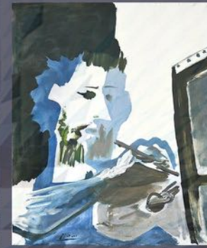
Pablo Picasso - The Painter (1963), lost in a plane crash.

The album's tracks are musical interpretations of destroyed, lost, or not yet found stolen paintings.