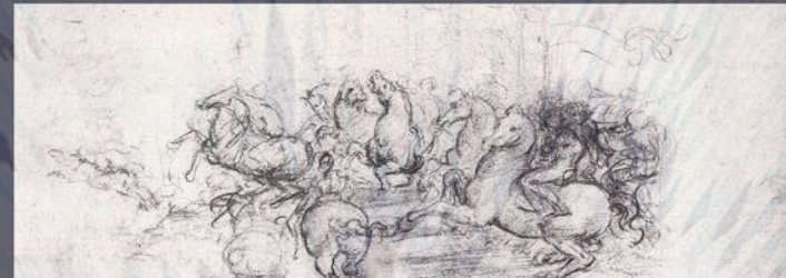
Leonardo da Vinci - The Battle of Anghiari (1505), charcoal study for the fresco. Evidence suggests it is under later frescoes in the Palazzo Vecchio.