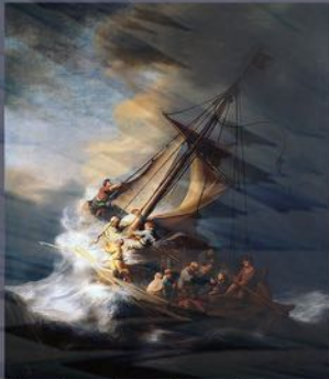
Rembrandt van Rijn - Storm on the Sea of Galilee (1633), stolen.