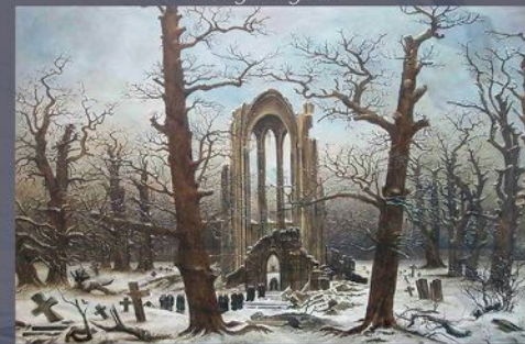
Caspar David Friedrich - Cloister Cemetery in the Snow (1818), disappeared in 1945.