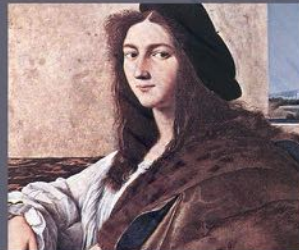
Raphael - Portrait of a Young Man (c. 1513), stolen by the Nazis, missing since World War II.