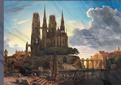
Carl Friedrich Schinkel - Cathedral Towering Over a Town (c. 1813). The original was destroyed by fire.